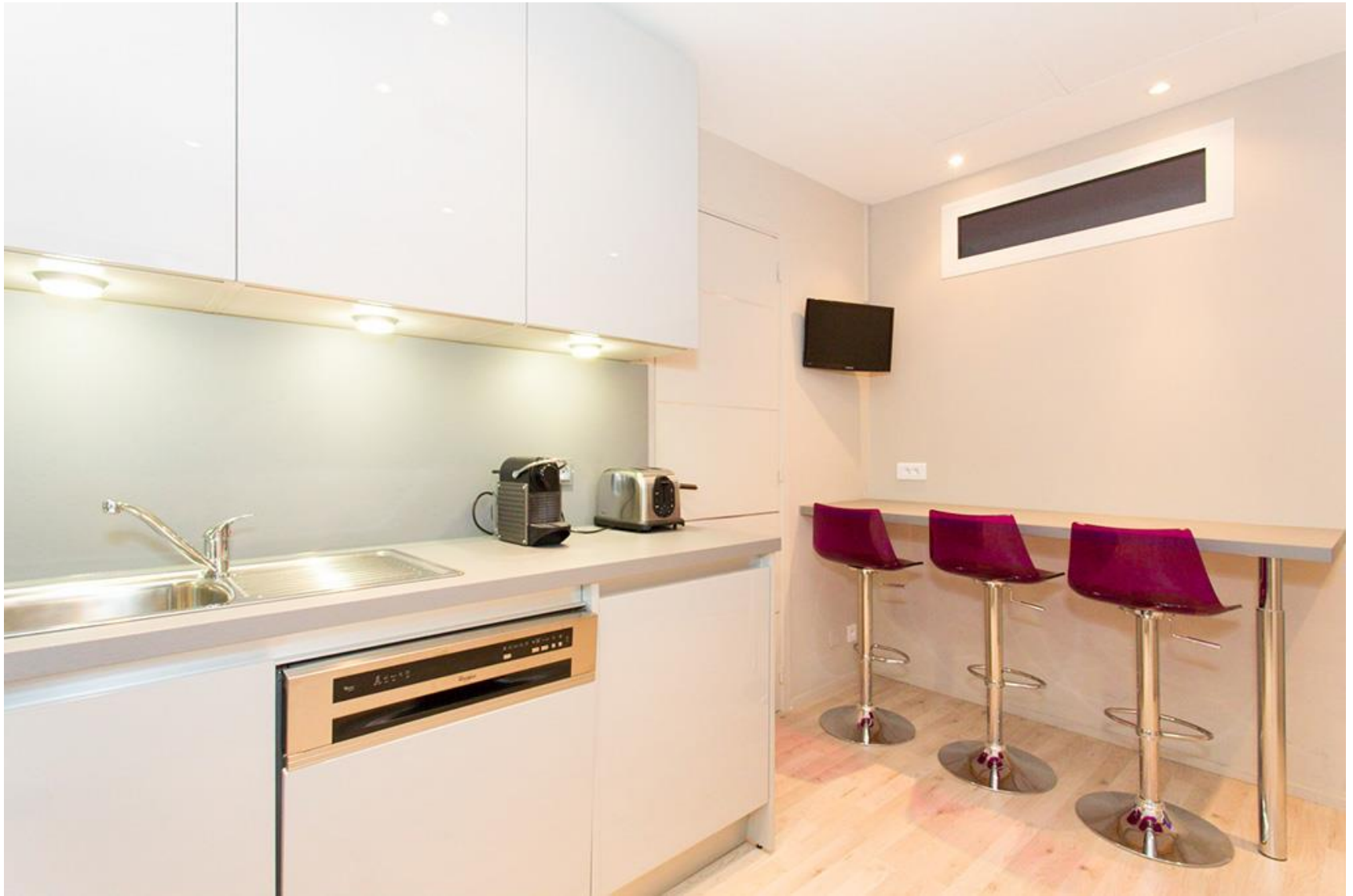
Bar area in the kitchen