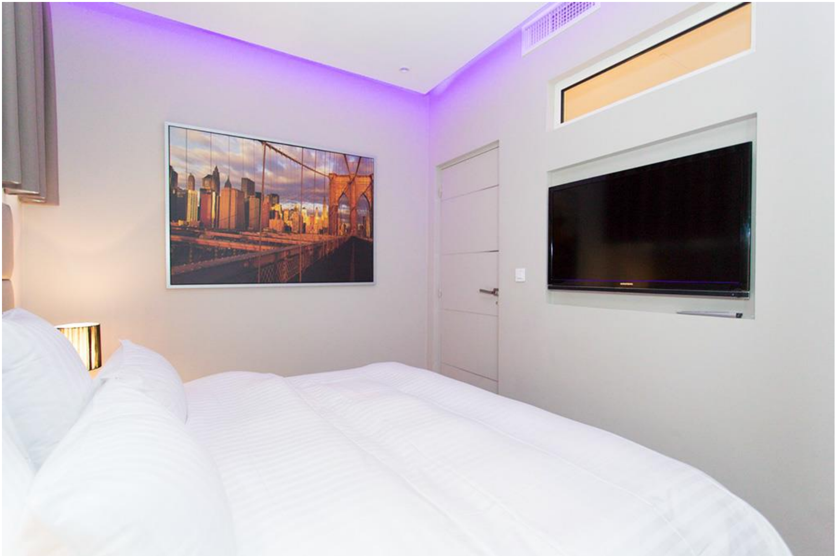
1st bedroom with cupboards, TV on the wall & led lights