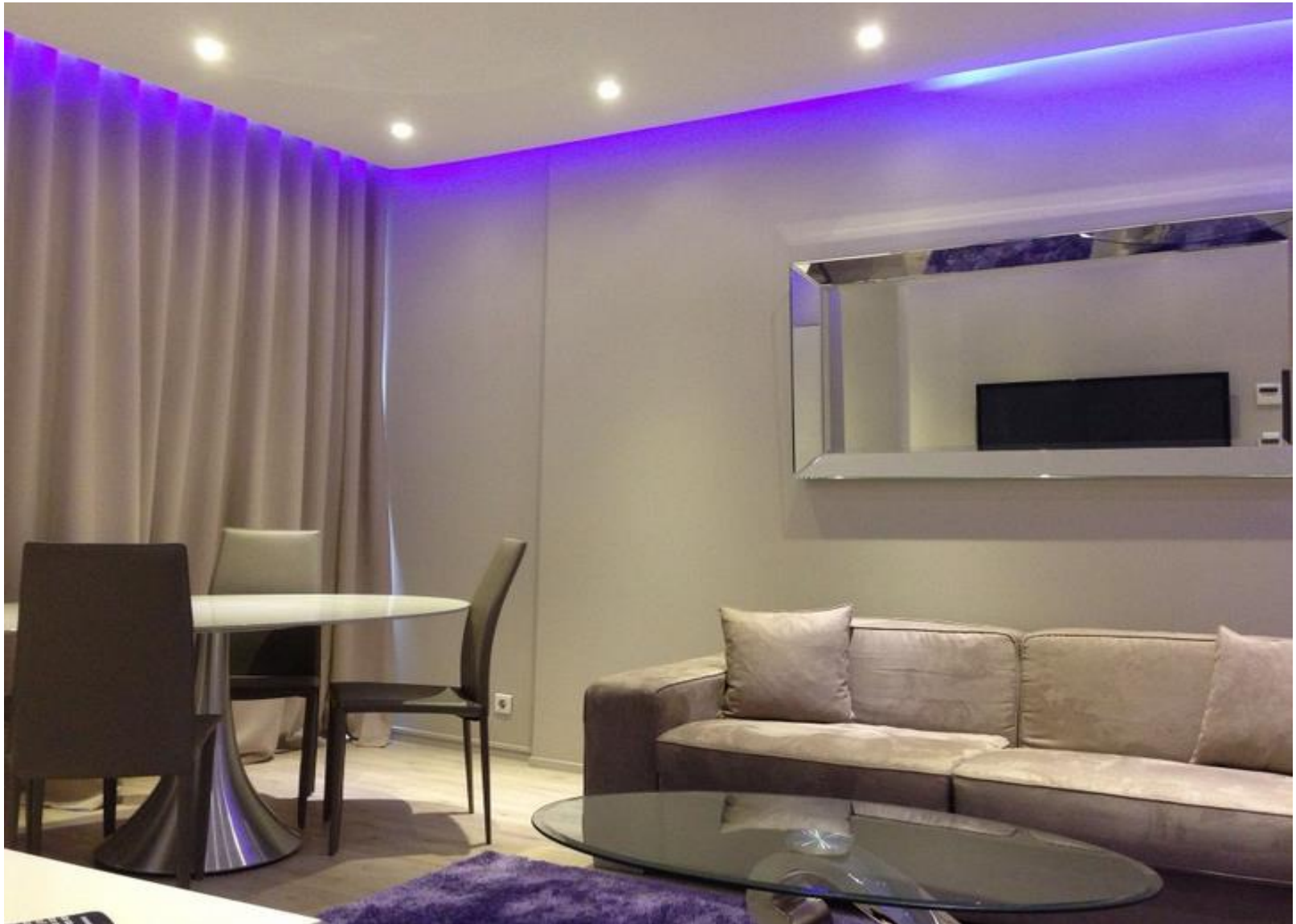
Living room with the curtains closed