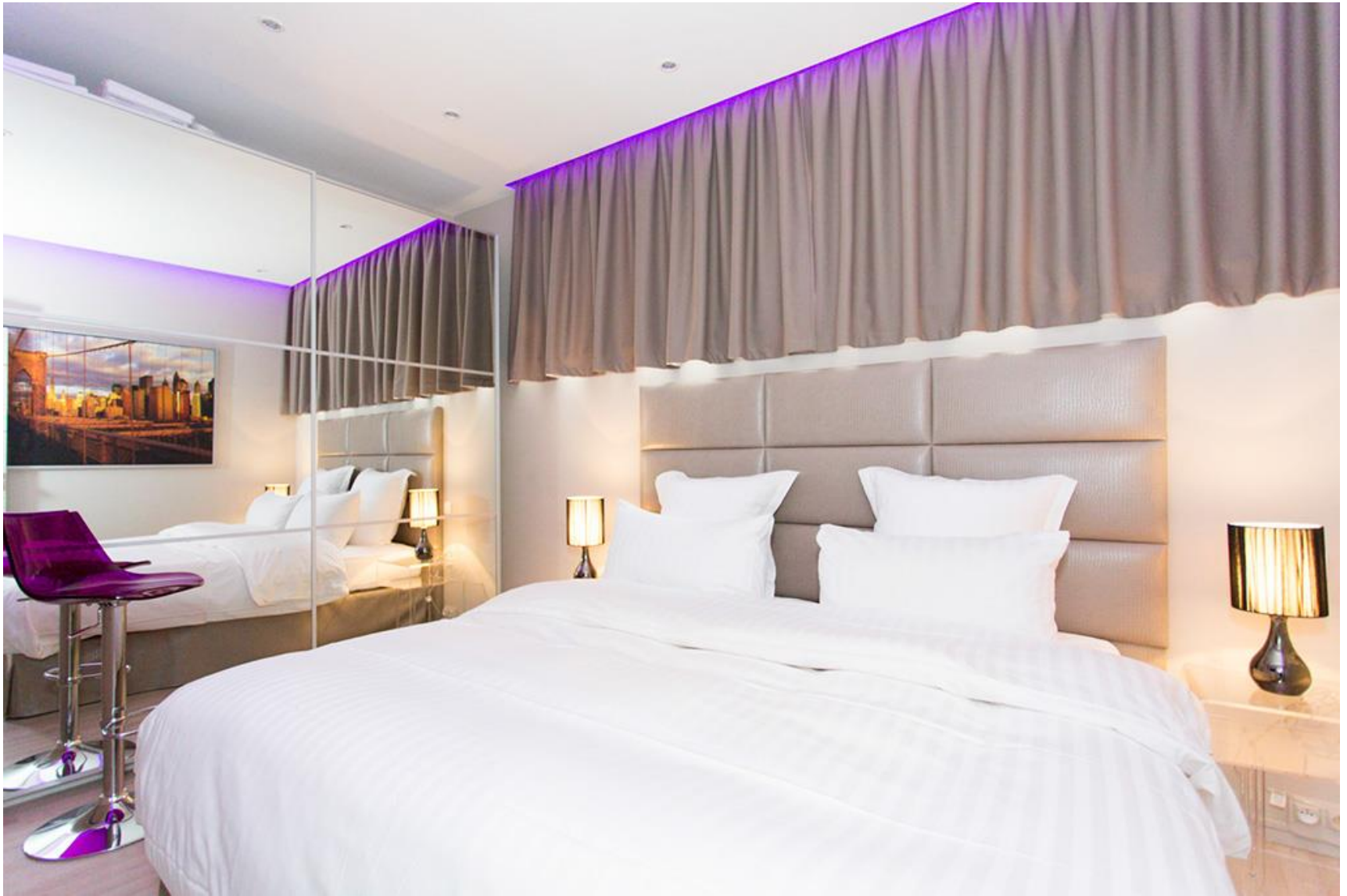
1st Bedroom with high quality mattresses