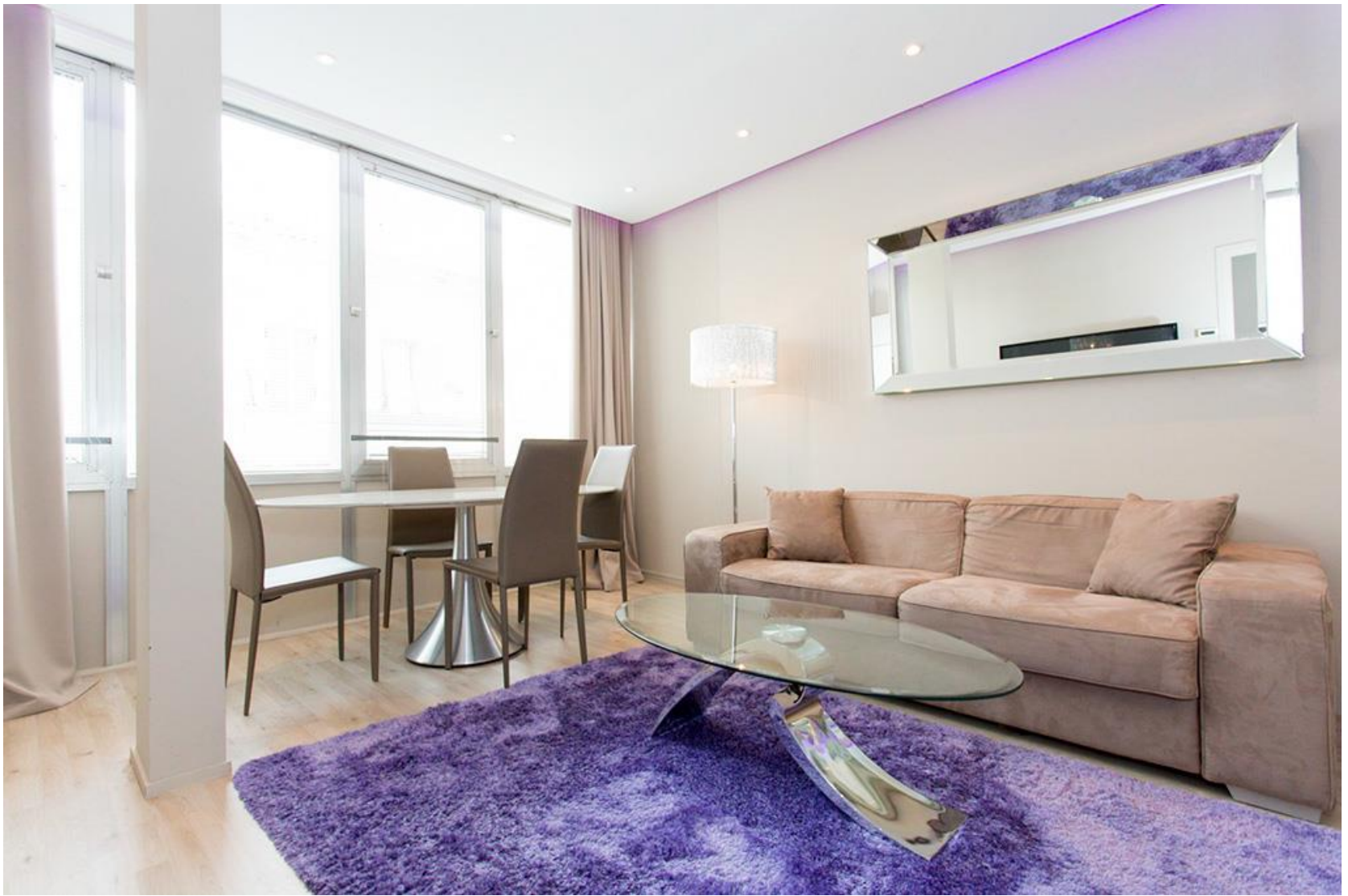
Living room with large dining table