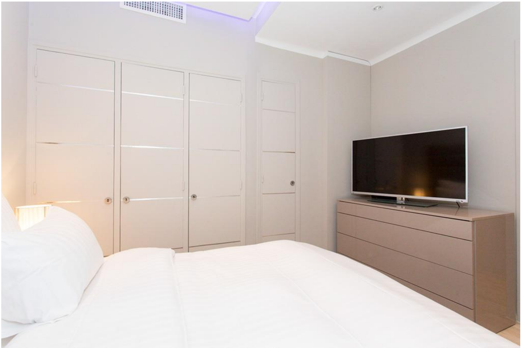
2 nd bedroom with cupboards, TV & led lights